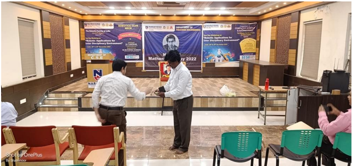
Shot on OnePlus By Shahenoor